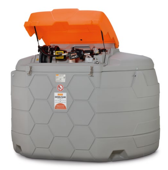
CUBE diesel tank 5,000L Outdoor Premium

If you wish to make use of unrestricted transportation according to the Craftsman Regulation (1.1.3.1 c ADR), you need to take some requirements into consideration. For example, the fact that no more than 1,000 litres of diesel may be transported. More information and a checklist on ADR approval can be found in our catalogue.